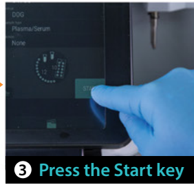
3 Press the Start key