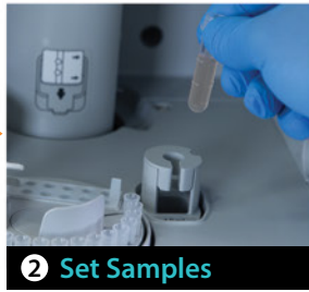
2 Set Samples