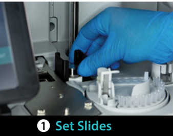
1 Set Slides