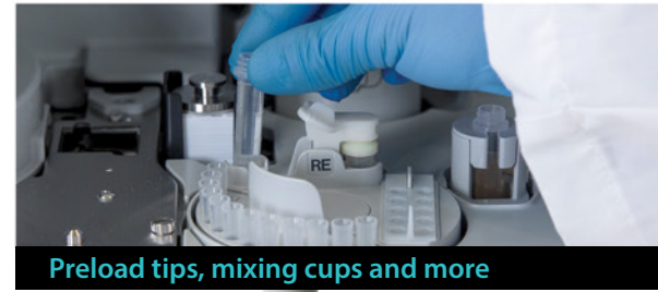
Preload tips, mixing cups and more